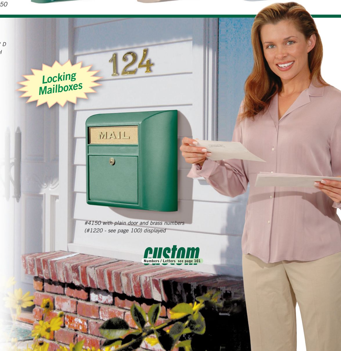
#4150 with plain door and brass numbers (#1220 - see page 100) displayed