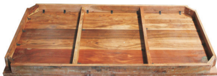
TOP X 1 (A)